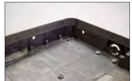
A housing ring increases component space without increasing external envelope size. Robotic adhesion ensures proper placement and bead size.