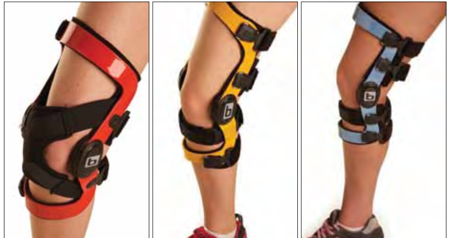
The Bledsoe 20.50 (left), AXIOM Mg (center) and Z-12 (right) knee braces use wrought magnesium framing components for exceptional stability and support following knee ligament or menisci injury or reconstruction.

The 20.50 Patellofemoral, AXIOM Mg Custom and Z-12 Magnesium ACL (anterior cruciate ligament) knee braces feature ultra-lightweight, low profile designs. Their high-strength magnesium components exhibit tremendous force resistance to protect and stabilize the knee joint. Bledsoe's breakthrough magnesium brace designs are up to 50 percent lighter than prior models. Patients benefit from an exceptionally comfortable knee brace that is durable over long-term use, enabling them to return to normal activities sooner, maintain an active lifestyle and achieve stable motion when participating in sports.