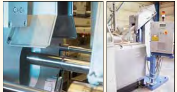
(Left) Resistance-heated nozzle heating, as mounted on a machine; (Right) Insulated furnace system optimizes heat distribution.

IMA applauds these pioneering magnesium companies that have taken essential steps and made outstanding progress in environmental responsibility. In doing so, they are revitalizing manufacturing and product innovation capabilities while saving energy, resources, time, and money. IMA urges all those involved in the production, processing, forming, manufacturing, and recycling of magnesium and magnesium alloys to set the bar ever-higher to achieve sustainable innovation and best practices.