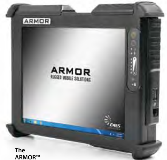
The ARMOR™ X10mg Rugged Tablet PC has a magnesium alloy chassis and sealed fanless design that delivers all-weather functionality for rugged outdoor computing.

The bonded joint design captures the outside ring edges at the inside housing wall. This strong bond must handle machining operations for the o-ring groove and stringent vibration and drop testing by the customer. The ARMOR™ X10mg rugged Tablet PC retains a lightweight yet rugged and durable framework with precision cast magnesium, while maintaining the original design integrity and heat transfer specifications. DRS Tactical Systems and TCDC's solution demonstrates how magnesium parts integrate with and enhance materials such as aluminum, resulting in a better and more efficient product.