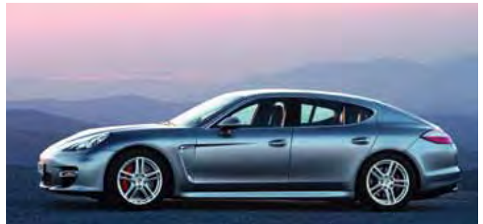
The Porsche Panamera sedan's magnesium side window frames achieve a flat W-profile around the window with precision pressure casting.

Georg Fischer GmbH & Co., KG, Altenmarkt, Austria, has won the IMA Award of Excellence in the Cast Product Automotive Design category for its magnesium window frame for the Porsche Panamera sports sedan. Working closely with Porsche AG, they used magnesium alloy AM50 for the Panamera's window frames in order to further reduce weight and place the vehicle's center of gravity as low as possible.