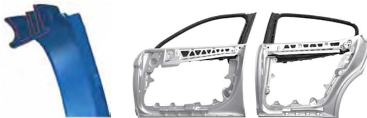
Left: W-profile for window frame casting; Right: Lightweight magnesium window frames integrate perfectly with Georg Fischer's cast aluminum door frames, forming the optimal hybrid construction for Porsche's four-door Panamera sedan.

The inside portion of the frames are visible and this is where the frames are joined to the casting system. To accommodate this, Georg Fischer mills and grinds the framing and applies a manual finish, then drills holes and applies connection surfaces for assembly. A three-layer protective coating is applied by an external partner to prevent corrosion. Prior to completion, window frames are precisely aligned to within three tenths of a millimeter, since the plastic strip attached to the frame forms a surface that is virtually flush with the window glass. Close-tolerance screws then attach the magnesium window frames to the cast aluminum door frames at Porsche's factory in Leipzig, Germany.