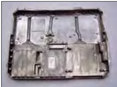
A magnesium housing with cast-in aluminum heat-sink achieves light weight and better heat dissipation capability.

TCDC's challenge was to convert an aluminum hog out housing into a die-cast magnesium housing in order to maintain size specifications while developing a lighter weight unit with the necessary heat dissipation. TCDC accomplished these goals by using a cast-in aluminum heat sink inserted into the magnesium housing. Three cast tools were created – the heat sink, housing ring and back housing. The aluminum heat sink is inserted into the magnesium back housing cast tool to combine the parts, and the magnesium housing ring is glued into the back housing.