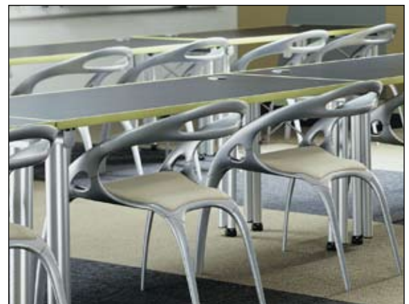
At just 23 inches wide, the magnesium Go Chair is an ideal choice for conference or training rooms.

“Since 2001, we’ve produced about four thousand Go Chairs,” says Campbell. “The chair has been purchased for use in restaurants, office conference rooms, lobbies, home offices, as well as television and movie sets.”