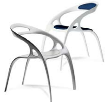
Neutral silver and white finish choices give the Go Chair universal appeal.

All of Bernhardt Design’s seating has to pass Business and Institutional Furniture Manufacturers Association (BIFMA) testing. The tests measure the strength of the chair’s legs, back, arms, and seat, determining its safety and fitness for use.