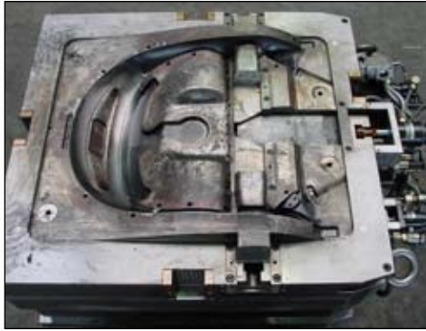
In phase one of the manufacturing process, this die-cast tool is used for the upper back portion of the chair.

Bernhardt Design in Lenoir, North Carolina was eager to work with Lovegrove, revering his reputation for leading the furniture design industry in manufacturing and processes.