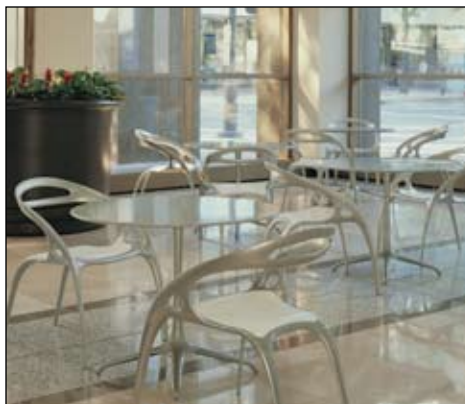
In a café setting, the Go Chair offers flexibility and comfort, and visually blends well with other natural building materials.