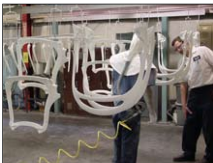
Go Chair backs, legs, and feet receive white powder coating on the production line.

The Go Chair's timeless design flair is immediately apparent. Lovegrove emulates the logic and beauty found in nature, gravitating toward working with natural materials. The ergonomic design is also comfortable, a feature not often associated with contemporary furniture.