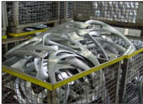
These magnesium test pieces are as-cast, untrimmed, unpolished, and unfinished chair back parts.

Magnesium was chosen to realize Lovegrove’s vision. Bernhardt Design sought to develop this new application for magnesium, specifying it over aluminum due to its light weight and high strength-to-weight ratio. Magnesium’s physical properties and aesthetic appeal presented the ideal design solution for a chair light enough to be stackable, yet strong and durable enough for commercial use.