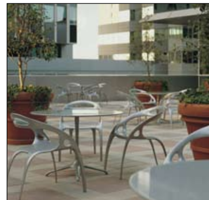
The stackable Go Chair demonstrates magnesium's durability, withstanding outdoor weather conditions with ease.

"Bernhardt Design first became aware of magnesium in design through the automotive industry."