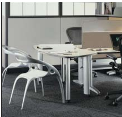
The clean lines and aesthetic appeal of the magnesium Go Chair marry form and function in modern office settings.